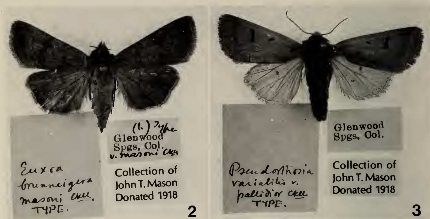
FIG. 2. Holotype of Euxoa brunneigera masoni Cockerell.